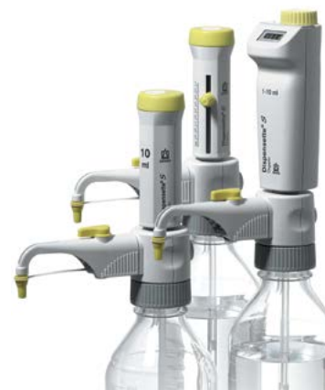
Dispensette® S Organic