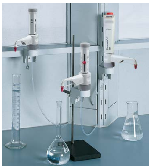
Remote Dispensing System for Dispensette® S