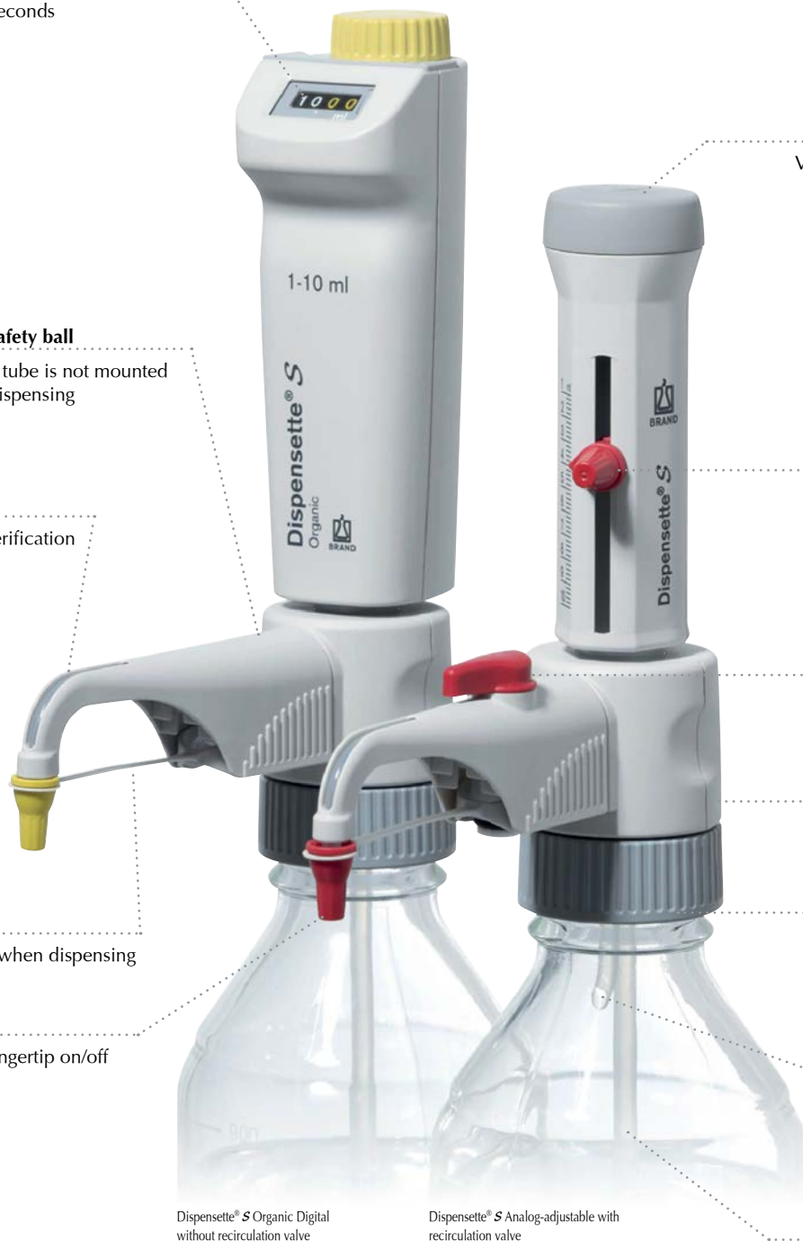
Dispensette® S Organic Digital without recirculation valve

Adjusts easily to a broad range of bottle sizes with no measuring or cutting required