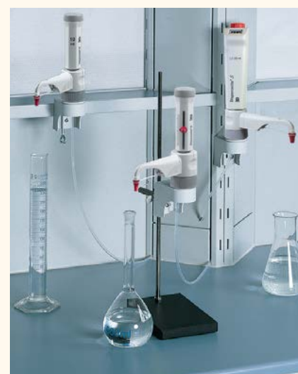
Remote Dispensing System

NOTE — Not for use with recirculation valve, pressurized vessels, peroxides (which will react with the platinum-iridium spring), HF or other liquids which attack borosilicate glass, alumina ceramic, PFA, ETFE, FEP or PTFE. Observe all safety instructions, operating exclusions, and limitations of your specific operating manual of the Dispensette® S bottletop dispenser model.