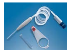
[2] Flexible discharge tube