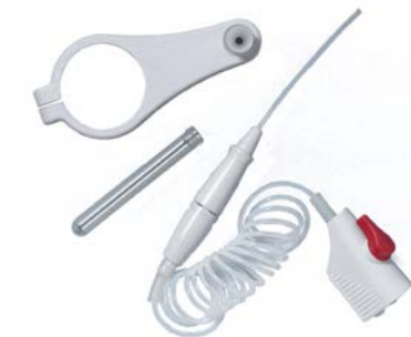
Flexible discharge tube