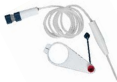
[3] Flexible discharge tube