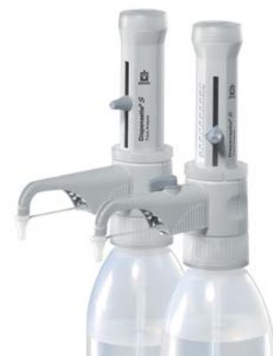
Dispensette® S Trace Analysis

A*=Accuracy, CV*=Coefficient of Variation