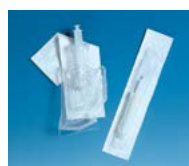
[2] Dispensing cartridge, sterile