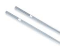
[3] Telescoping filling tubes, FEP