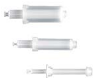
[1] Dispensing cartridge, non-sterile