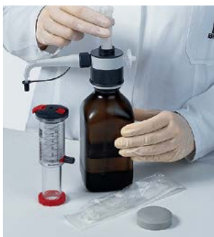
Sterile dispensing cartridge installation